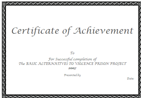
Certificate of Achievement